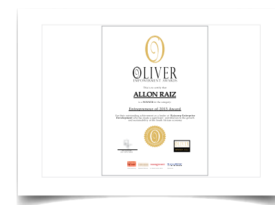
BRANDED AWARD CERTIFICATE Your company logo on all the Award winner and finalist certificates.

A representative from the sponsor will present the Award to the winner of your chosen category.