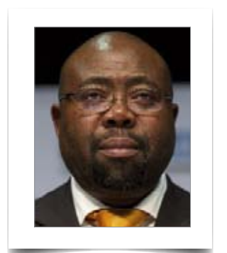
DEPUTY MINISTER THEMBELANI THULAS NXESI Department of Rural Development and Land Reform