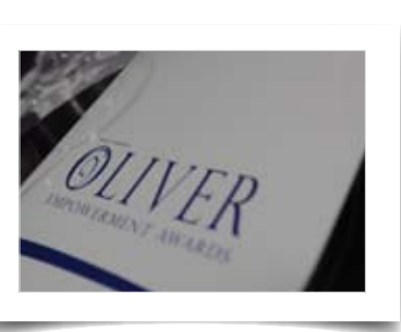
BRANDED AWARD PROGRAMME Your company logo on the Awards programme.