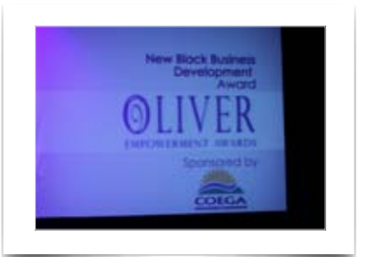
LOGO ON SCREENS

One table (10 seats) at the Oliver Empowerment Awards to entertain key clients or reward employees.