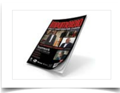
EDITORIAL COVERAGE Editorial coverage, company logo and picture in the 15th edition of the Impumelelo publication.