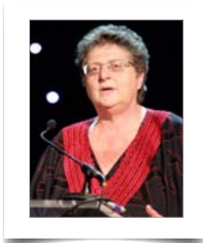
GOVERNOR GILL MARCUS South African Reserve Bank